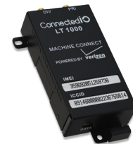
Connected IO LT1000 CAT 3 4G LTE/3G/2G Modem

In contrast to wired failover solutions or redundant service, 4G LTE technology offers dependable, cost-effective connectivity. Connected IO 4G LTE programmable modems—trusted for always-on network connectivity—maximize uptime, ensure rapid deployment, provide cost-effective scalability, and are easy to manage, even with limited IT resources.